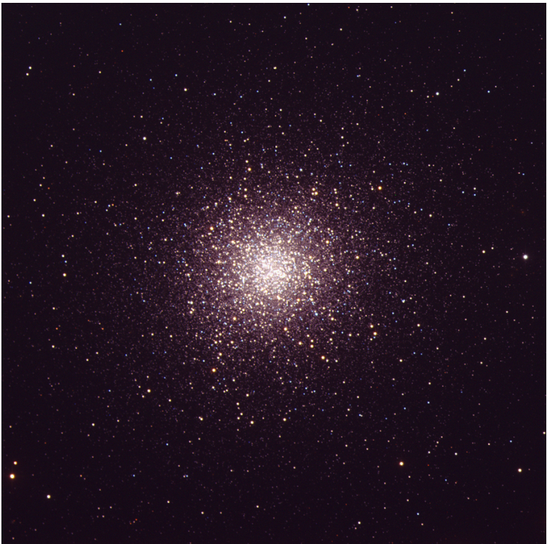
Messier 13, the globular cluster in Hercules.