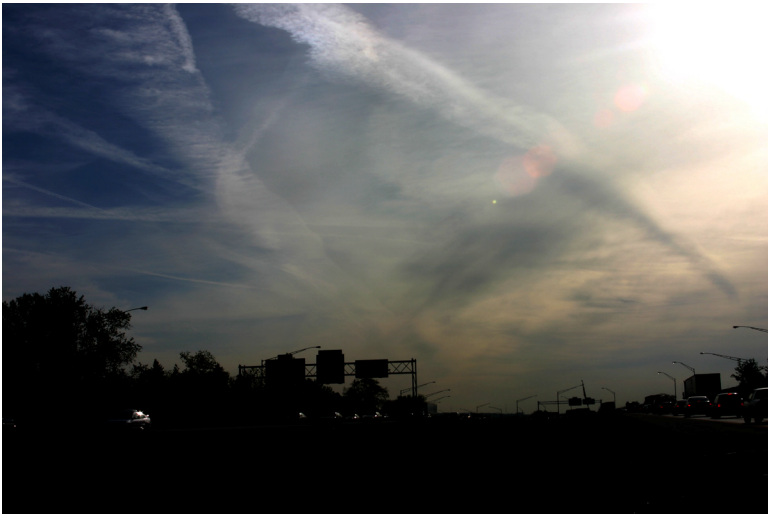
Contrail shadows falling on low-level haze.

The conclusion is that the chemtrail scare is a myth, most likely started by environmentalists to frighten people away from the airline industry. That would explain why, after 911 when the airline industry was depressed by the restrictions of the Federal government, chemtrails disappeared from the scare radar.