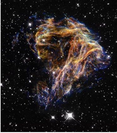
Left: Supernova remnant in the Large Magellanic Cloud.

produced in the explosion. Fortunately, the Lord created the earth so that there are no potential supernovae near enough to threaten earth. However, given their brightness, it is clear that supernovae in the Milky Way can be seen from earth.