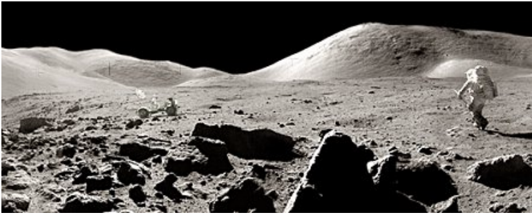
Above: Moonwalking astronaut Harrison Schmidt.